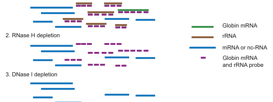
Fig. 1 Schematic Diagram of Globin mRNA and rRNA Removal